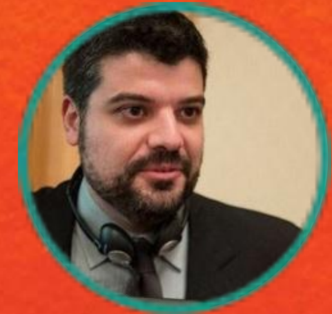
Otavio Neves Brazilian Office of the Comptroller General